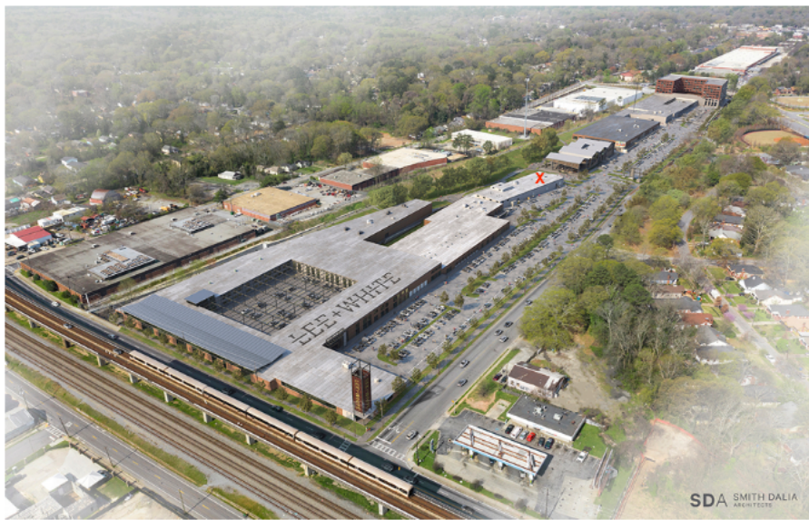
LEE + WHITE Entertainment District